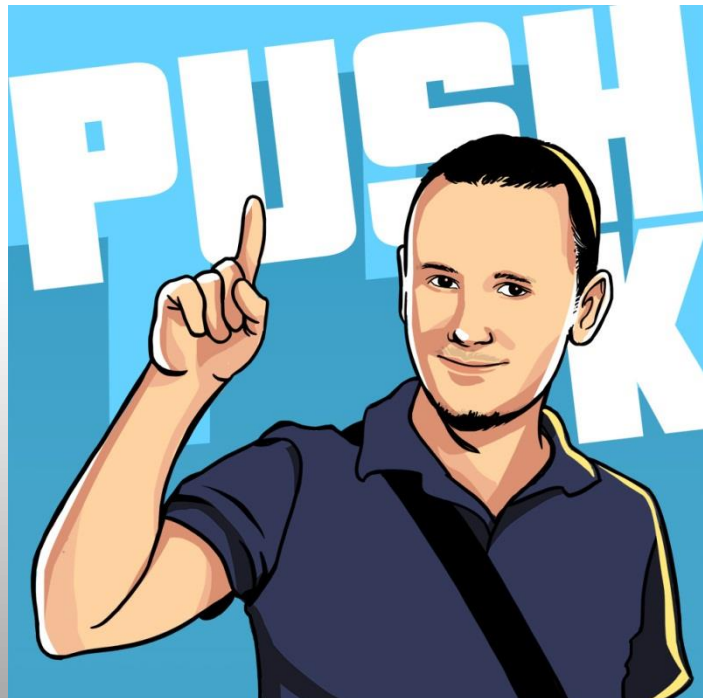
Founder and CEO of PUSH-K Solutions

“If you’re reading this text I suppose you’re looking for an agency and you have something special in mind. Let me tell you a bit about our agency: